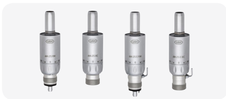
AM-25 RM, AM-25 BC, AM-25 E RM, AM-25 E BC W&H offers the optimal range of air motors for your Alegra straight and contra-angle handpieces.