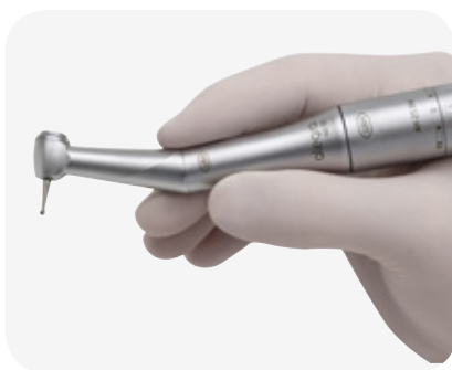
Perfect balance The contra-angle handpiece is comfortable in the hand and is perfectly balanced with the air motor.