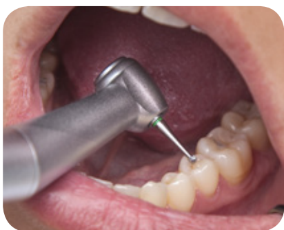
Fatigue-free operation due to the ergonomic design.

The excellent ergonomics prevent excessive strain on your hands during preparation. Discover the new Alegra straight and contra-angle handpieces for the most comfortable way to achieve the best results!