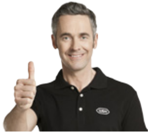
W&H Technical Service

»The better the care, the longer the pleasure.« Regular cleaning and care of your instruments protects them against premature wear and unnecessary service costs.