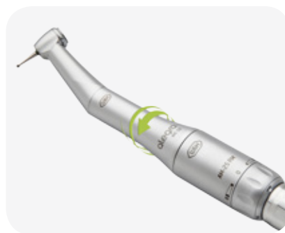
Excellent ergonomics Easy 360° rotation of the contra-angle handpiece on the air motor, low overall weight and slender design ensures fatigue-free operation.